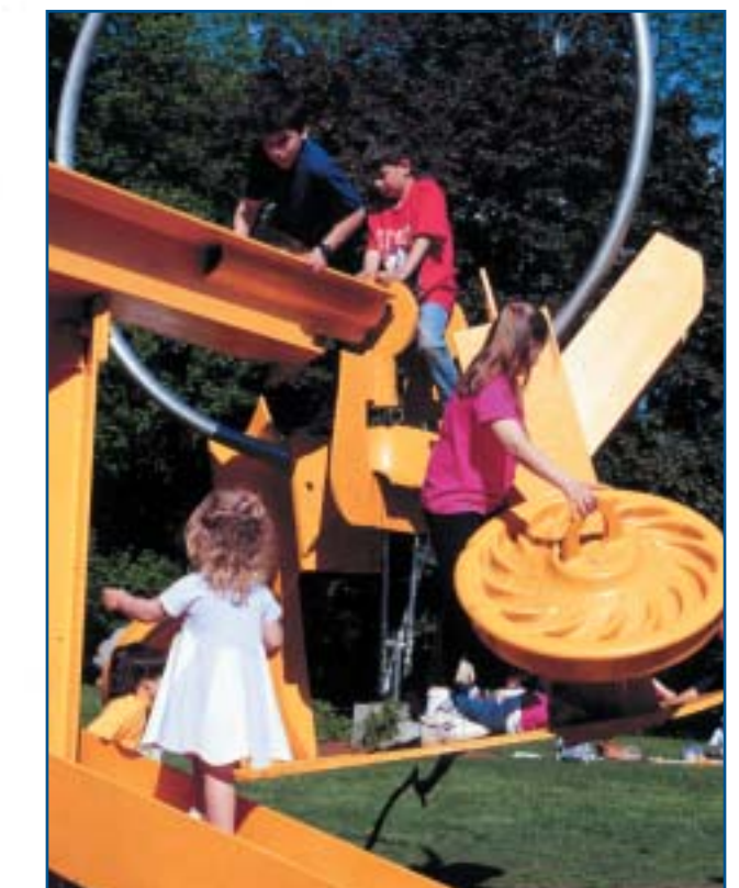
A range of programmed activities and artful park structures could be developed to attract people of all ages and backgrounds to the new Lower Mill Park.