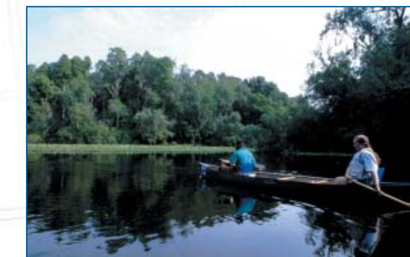
New boat landings and launch points will support a major increase in recreation on the water.