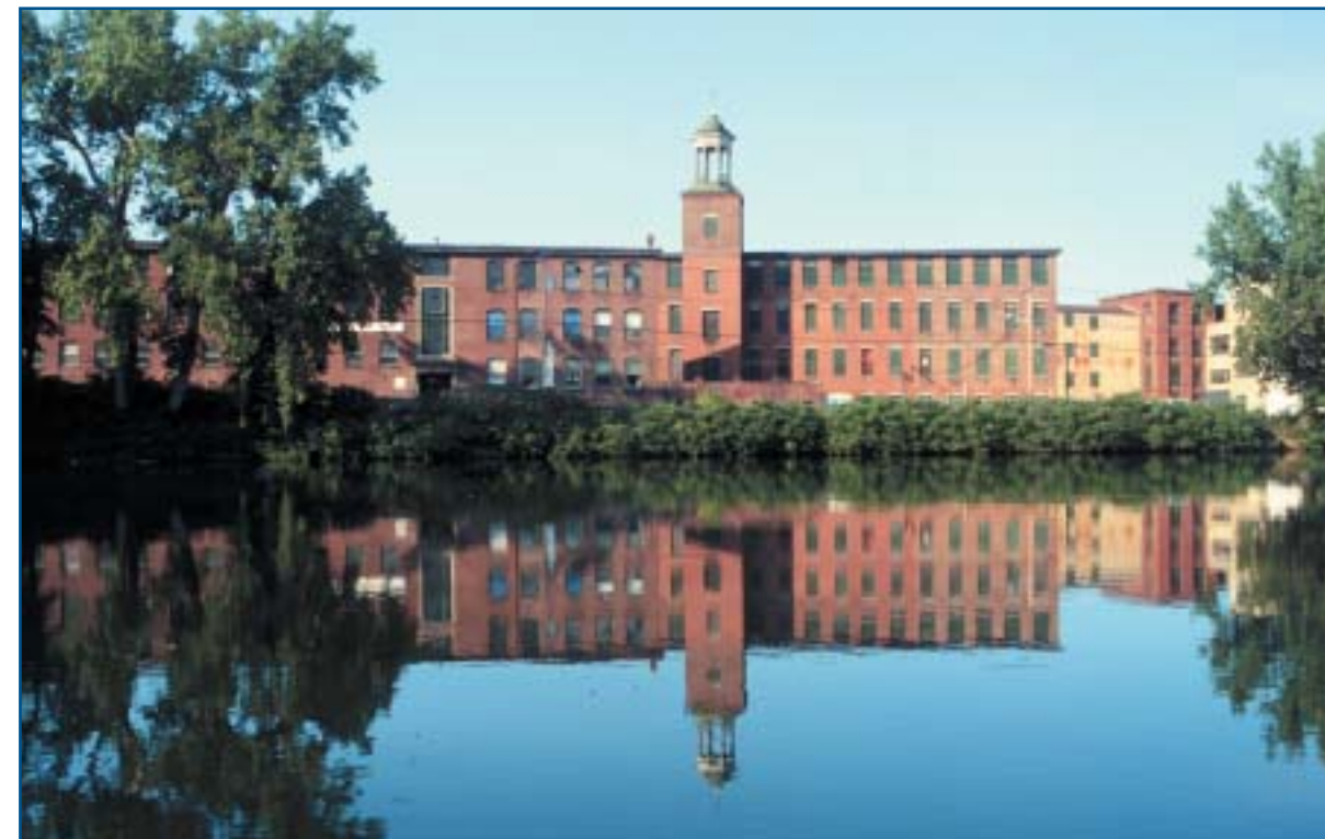
An improved Lower Mill Pond will be a catalyst for the redevelopment of historic mill buildings facing the pond.